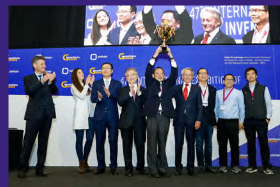
Grand Prix 2019 - for GRST Holdings Limited from Hong Kong for the first recyclable car battery.