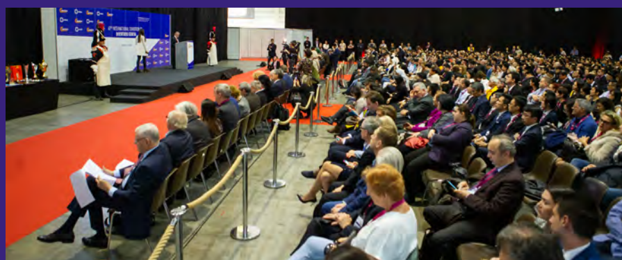
More than 1'000 exhibitors, personalities and journalists participate at the prize-giving ceremony