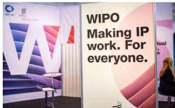
Stand of WIPO (World Intellectual Property Organisation) and IPI (Swiss Federal Institute of Intellectual Property)

The International Exhibition of Inventions of Geneva benefits from the most extensive support and privileges that can be granted to an exhibition. It is under the patronage of the Swiss Federal Government, the State, the City of Geneva and of the World Intellectual Property Organization - WIPO.