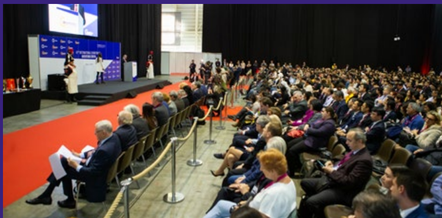
More than 1'000 exhibitors, personalities and journalists participate at the prize-giving ceremony