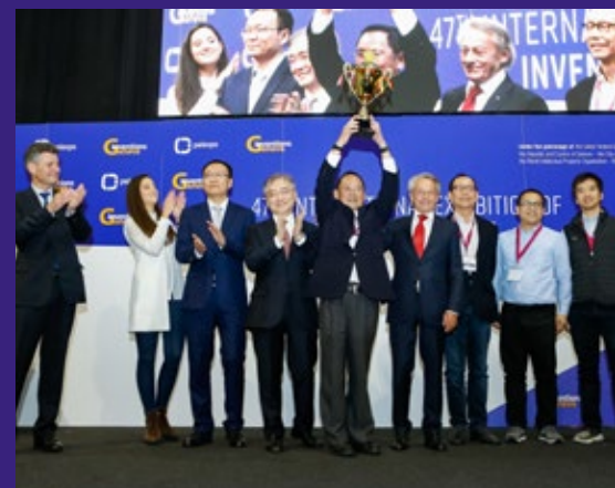
Grand Prix 2019 - for GRST Holdings Limited from Hong Kong for the first recyclable car battery.