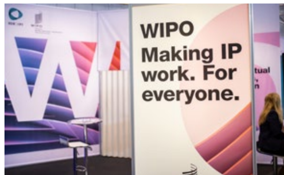
Stand of WIPO (World Intellectual Property Organisation) and IPI (Swiss Federal Institute of Intellectual Property)

The International Exhibition of Inventions of Geneva benefits from the most extensive support and privileges that can be granted to an exhibition. It is under the patronage of the Swiss Federal Government, the State, the City of Geneva and of the World Intellectual Property Organization - WIPO.