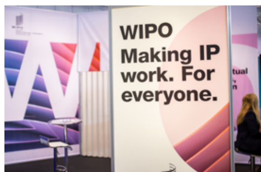
Stand of WIPO (World Intellectual Property Organisation) and IPI (Swiss Federal Institute of Intellectual Property)

Under the patronage of the Swiss Government, the Republic and Canton of Geneva, the City of Geneva and of the World Intellectual Property Organization – WIPO, The International Exhibition of Inventions Geneva benefits from the most extensive support and privileges that can be granted to an exhibition. This support testifies to the usefulness, relevance, and remarkable quality of this event, recognized as the world's foremost exhibition of inventions. It is also the highly international, with the participation of 45 countries.