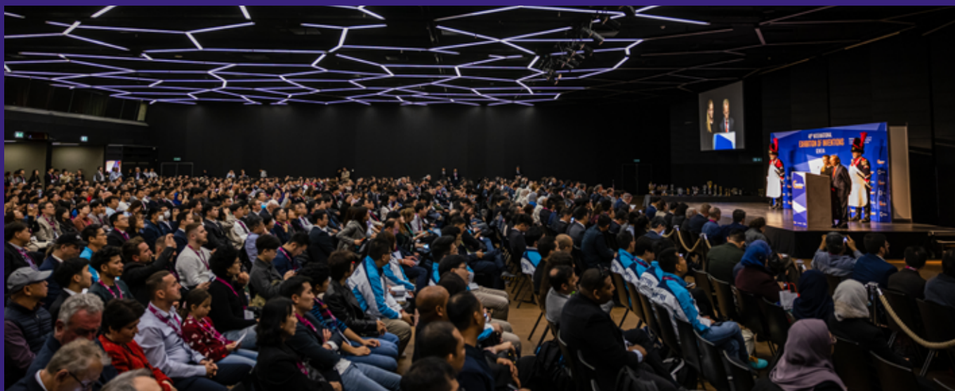
More than 1'000 exhibitors, personalities and journalists participate at the prize-giving ceremony