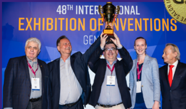
Grand Prix 2023 – for Université de Versailles Saint-Quentin en Yvelines, France and the Moldova State University for a non-toxic molecule which strengthens bees against external aggressions.