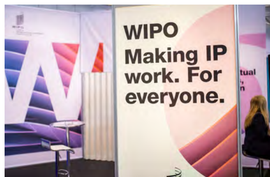
Stand of WIPO (World Intellectual Property Organisation) and IPI (Swiss Federal Institute of Intellectual Property)

Under the patronage of the Swiss Government, the Republic and Canton of Geneva, the City of Geneva and of the World Intellectual Property Organization – WIPO, The International Exhibition of Inventions Geneva benefits from the most extensive support and privileges that can be granted to an exhibition. This support testifies to the usefulness, relevance, and remarkable quality of this event, recognized as the world's foremost exhibition of inventions. It is also the highly international, with the participation of 45 countries.