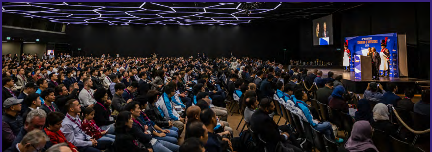
More than 1'000 exhibitors, personalities and journalists participate at the prize-giving ceremony