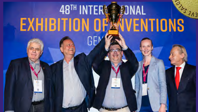
Grand Prix 2023 – for Université de Versailles Saint-Quentin en Yvelines, France and the Moldova State University for a non-toxic molecule which strengthens bees against external aggressions.